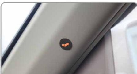
LED Visual Alert